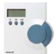
T7560A, B (white/blue)