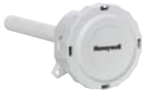
H7655B, H7625B, H7635B