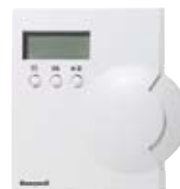
T7560A, B (all white)